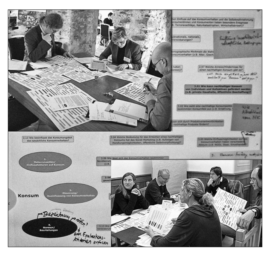
Figure 1: Synthesis seminar participants discussing the research landscape (November 2009)

Consumption Research, version 2.0". The interview questions had been sent to the project groups in advance with the request to reach a consensus within the groups on a joint response prior to the scheduled interview. The interview questions firstly concerned the description of the research landscape (intelligibility and comprehensiveness of the comments; terminology; gaps; need for changes); secondly, they referred to the research landscape per se (terminology and intelligibility; research questions that could not easily be placed; questions lacking in precision or specificity; overly detailed questions; unnecessary questions; need for changes); thirdly, each project group was invited to locate their research questions within the research landscape.